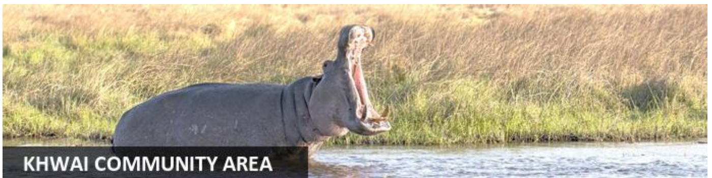
KHWAI COMMUNITY AREA