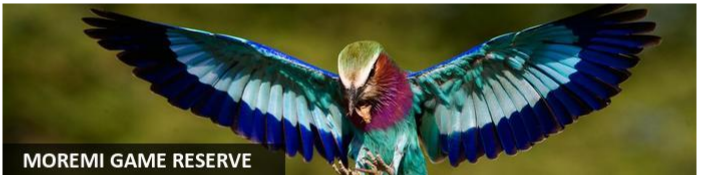
MOREMI GAME RESERVE