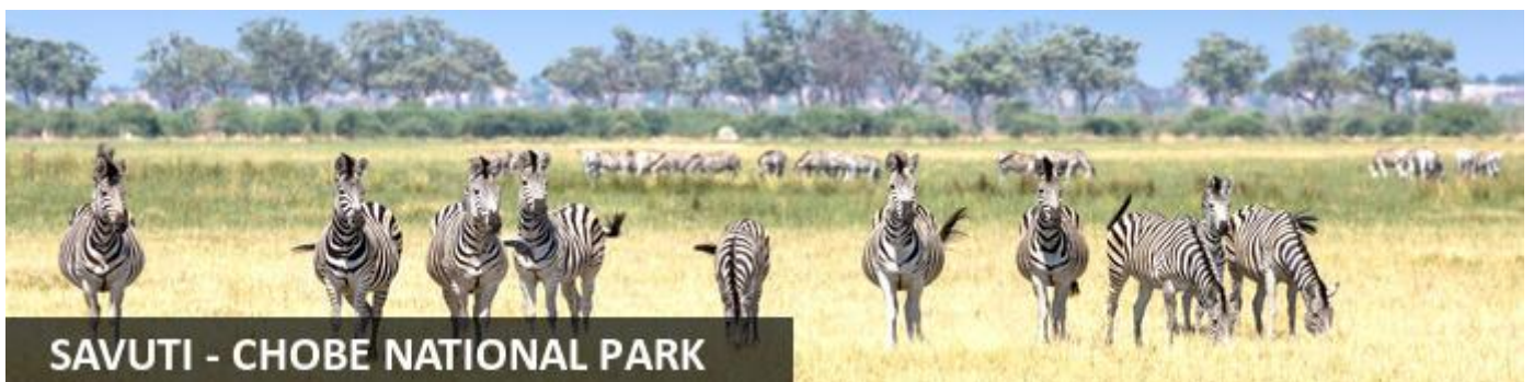
SAVUTI - CHOBE NATIONAL PARK