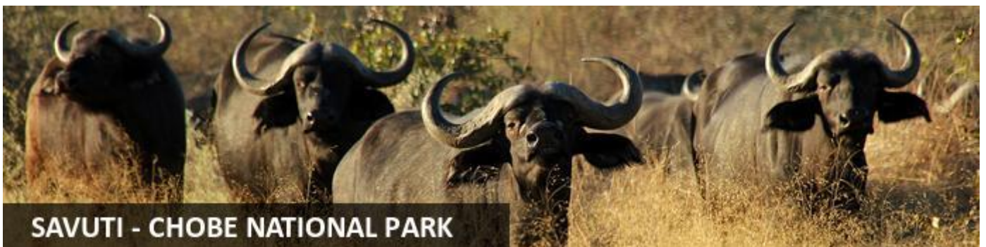
SAVUTI - CHOBE NATIONAL PARK