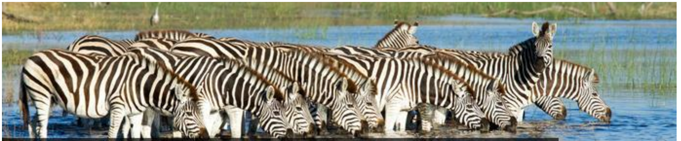
BOTETI RIVER - MAKGADIKGADI PANS NATIONAL PARK