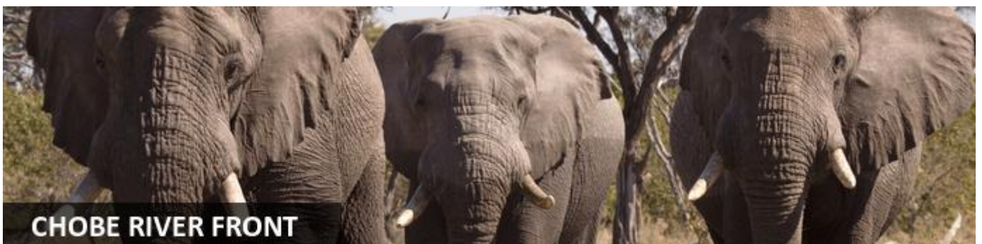
CHOBE RIVER FRONT